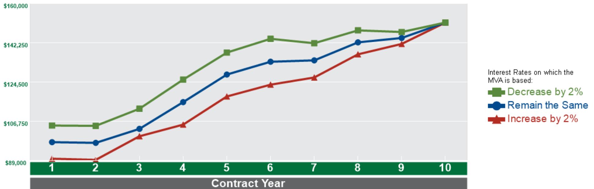
Hypothetical Surrender Values Reflecting MVA

The graph below shows the projected surrender value under sample MVA scenarios as described below during the surrender charge period of the Contract based on the initial premium amount and the assumption that there are no partial surrenders.